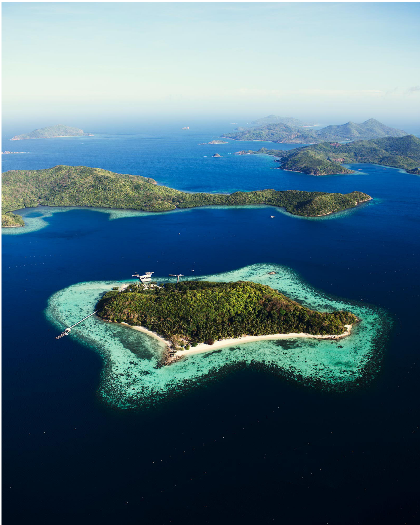
branellecs archipelago is one of more than 7000 islands on the philippines