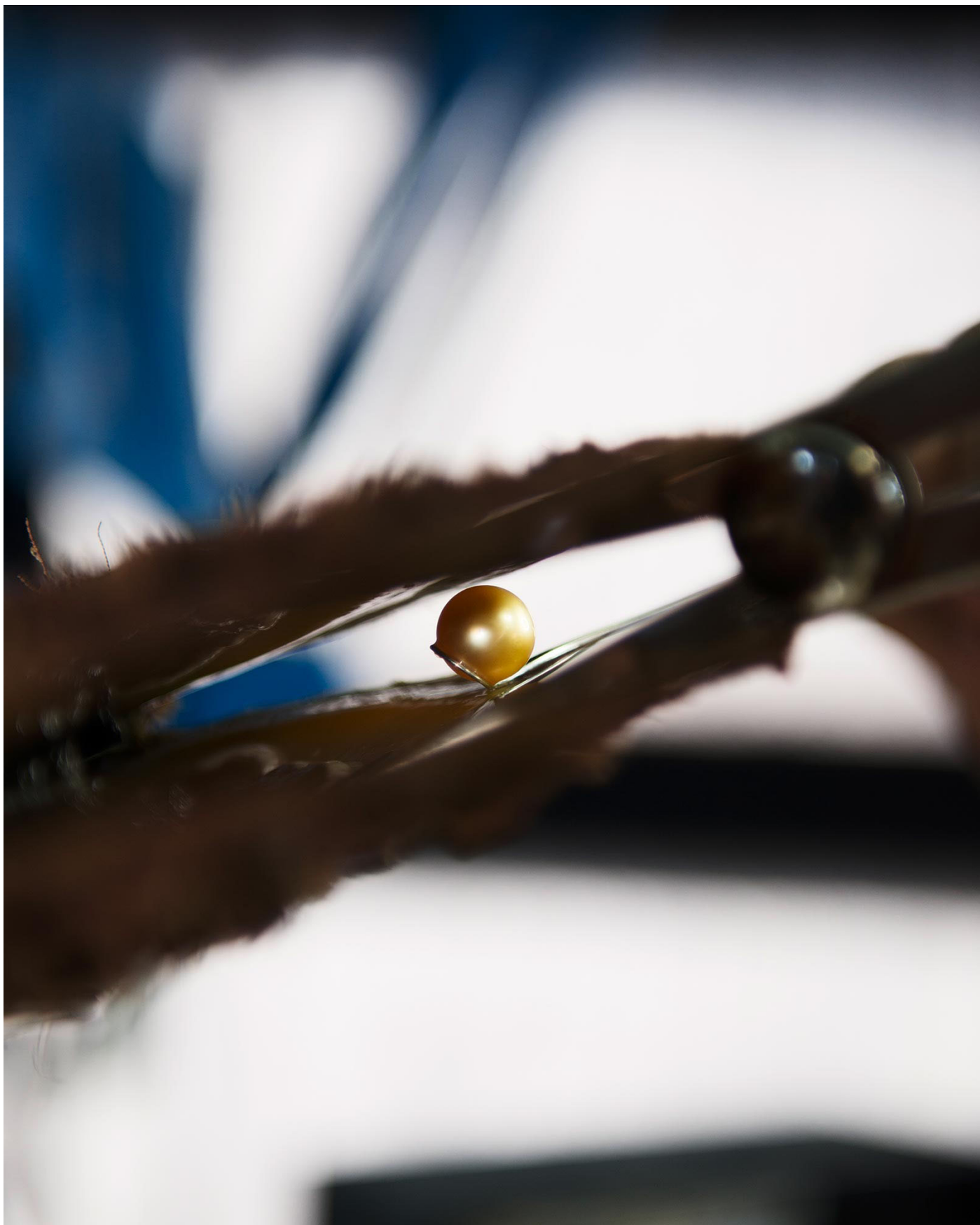
after four years the pearls are ready to harvest