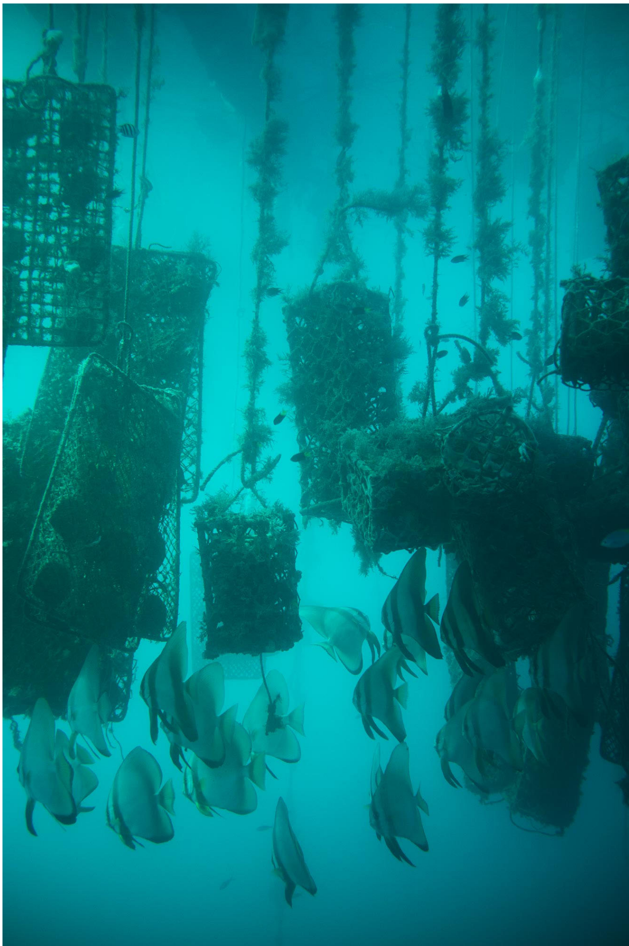
...from a depth of twelve meters