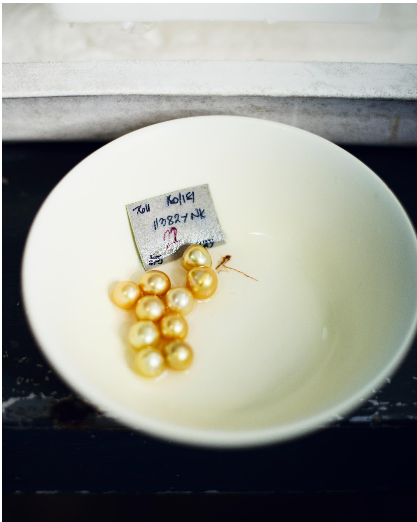
20g pearls; market price 30.000 euro