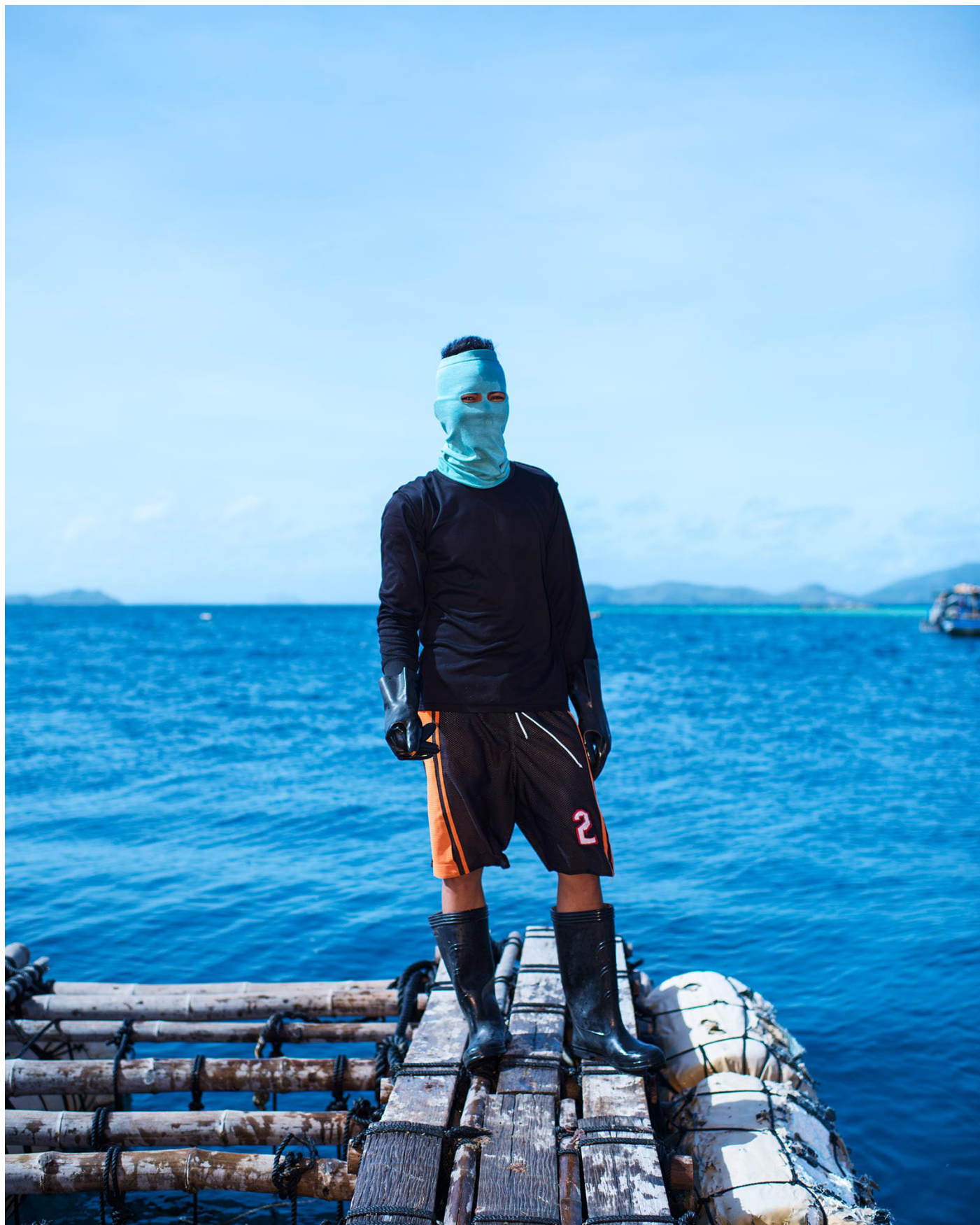
storm hoods protect against the tropical sun