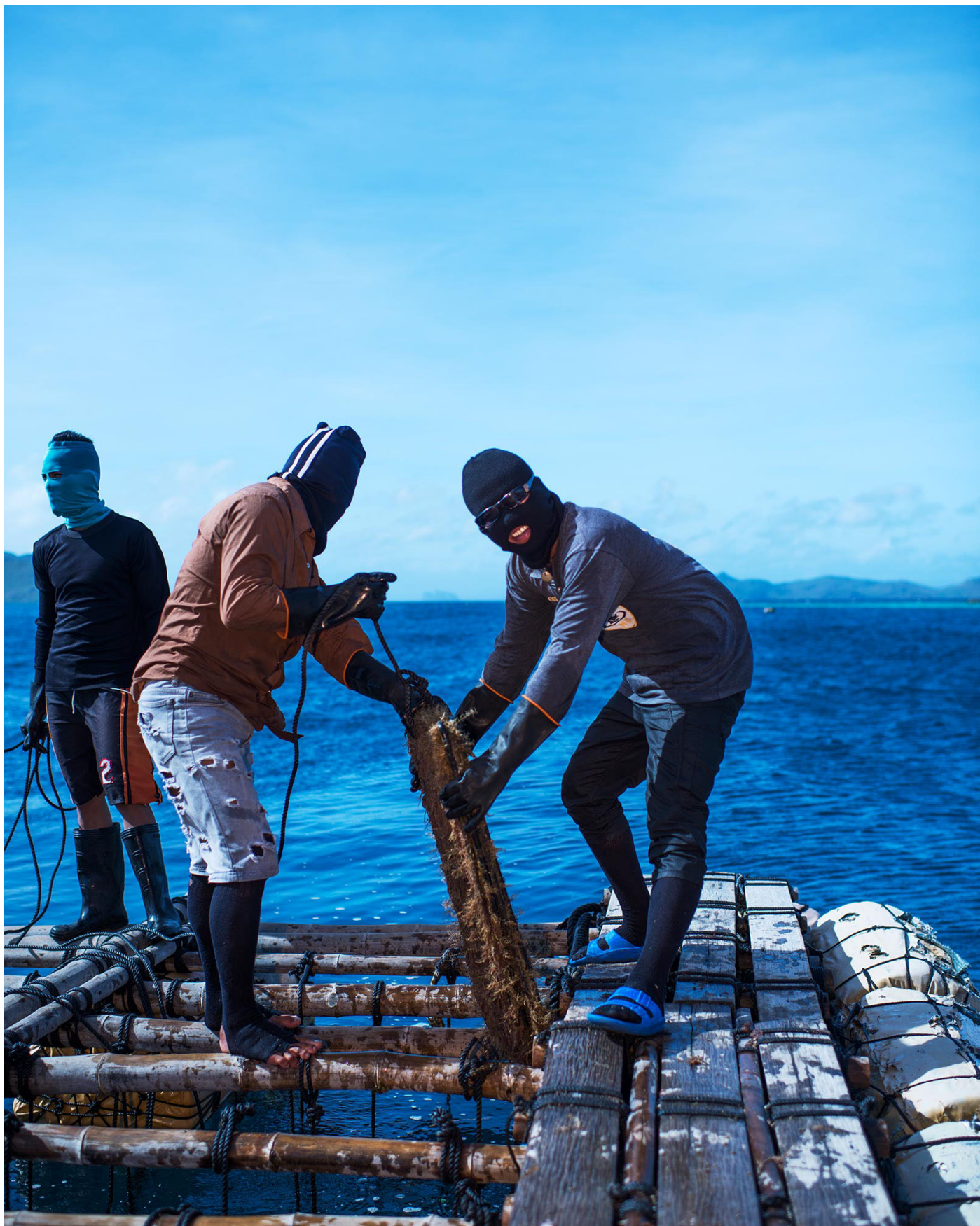
this is how to lift a treasure: workers pulling up the oyster cages...