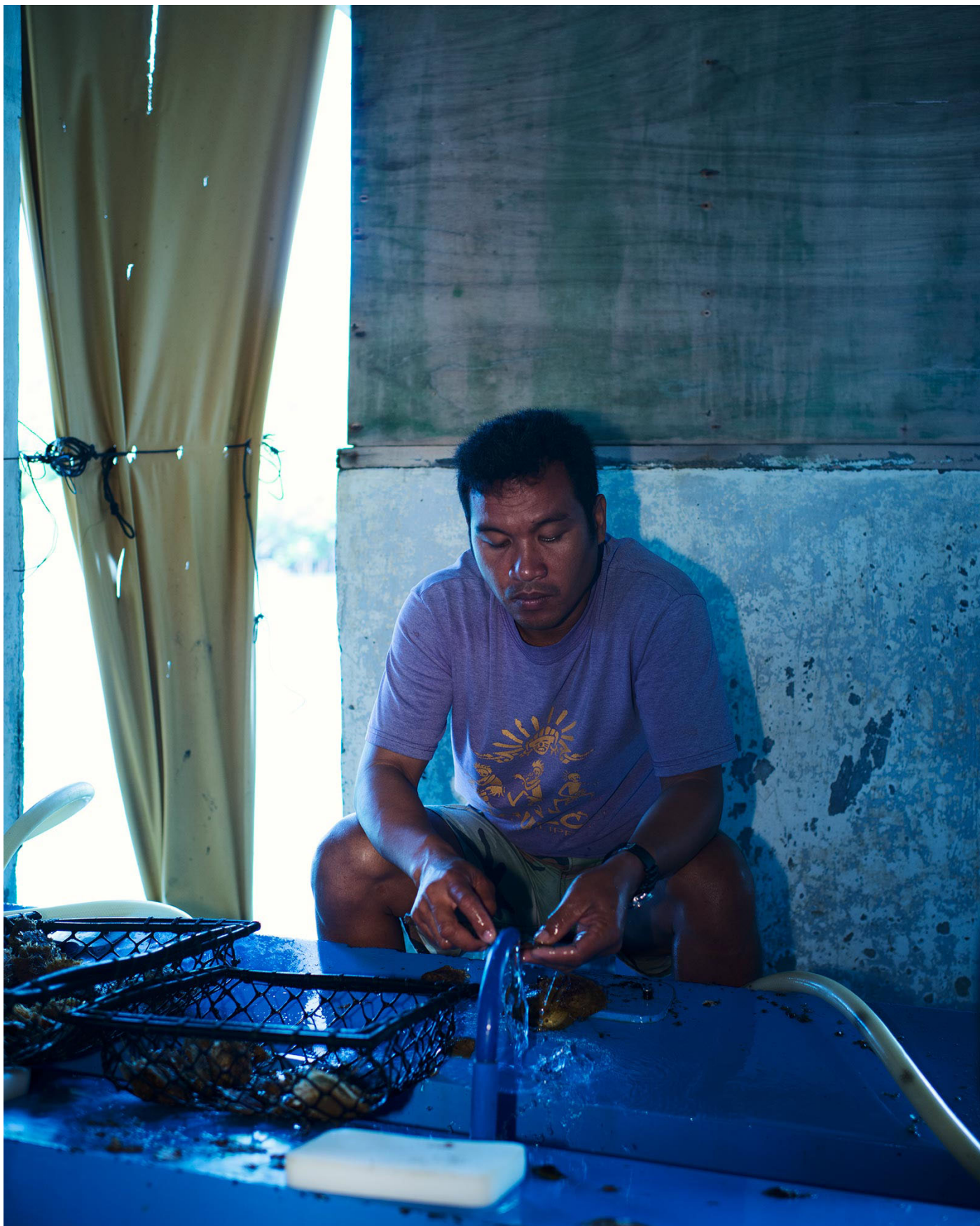
once a week the oysters need to be cleaned