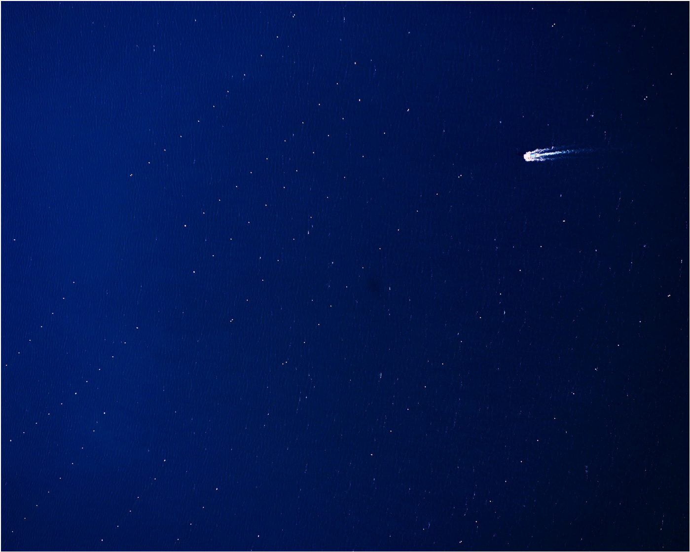
boat patrols along the buoy rows