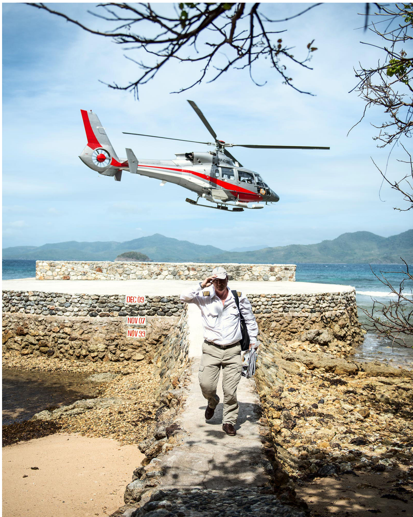
arrival at pearl harbor