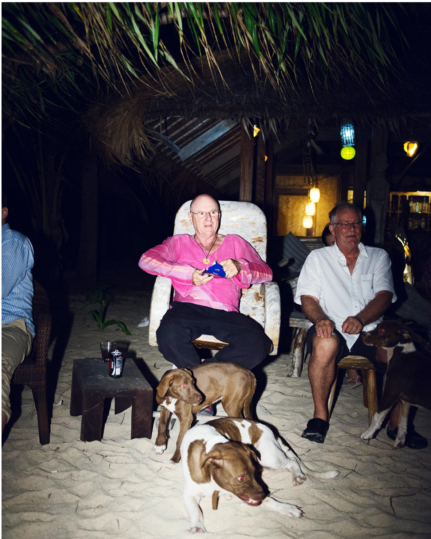
after-hours on the private beach