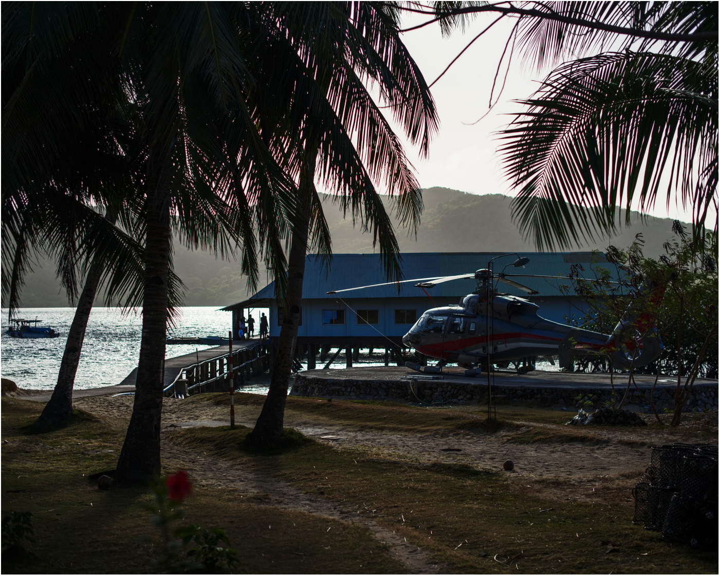
the exact location? top secret