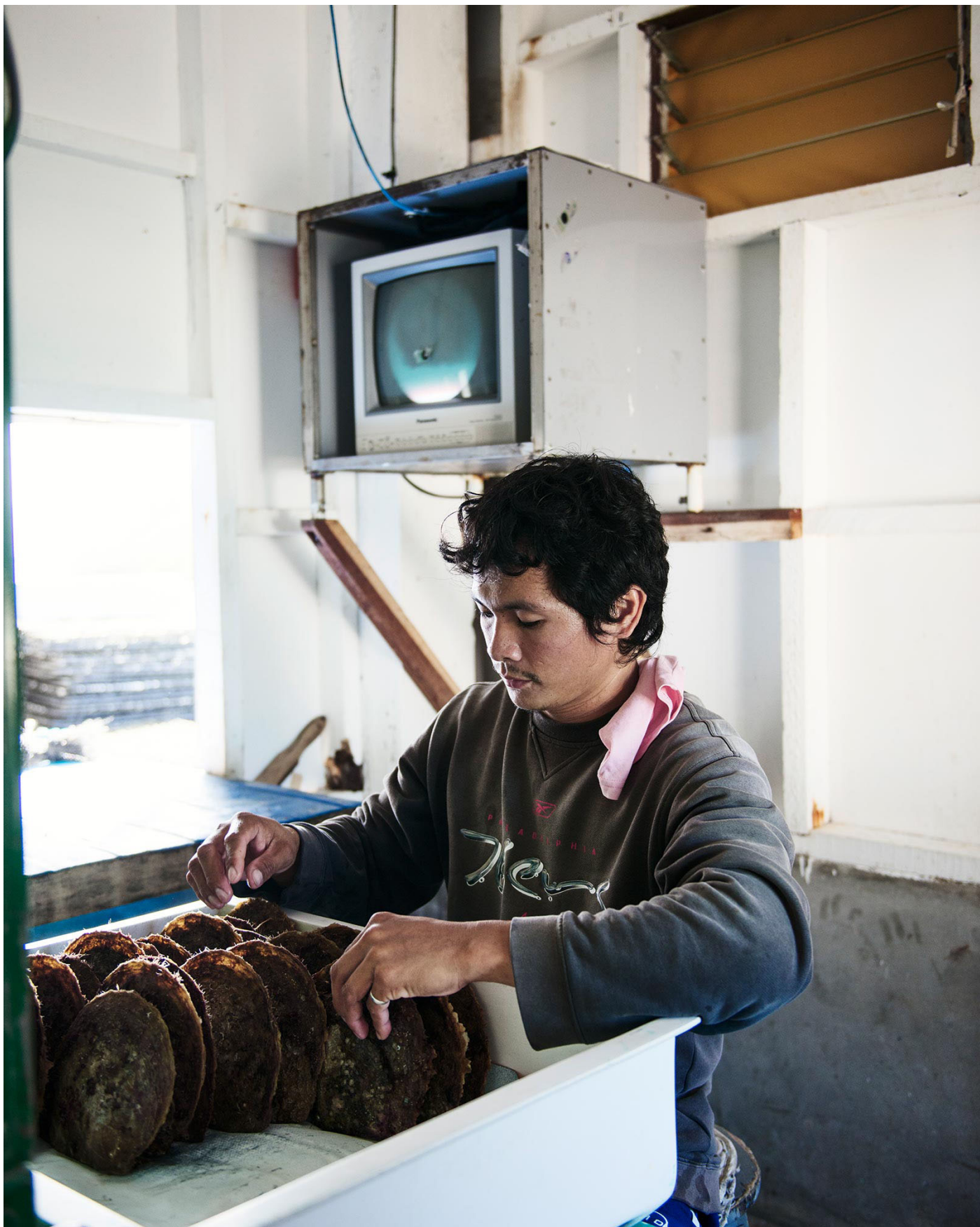
x-ray reveals the exact size of the pearl