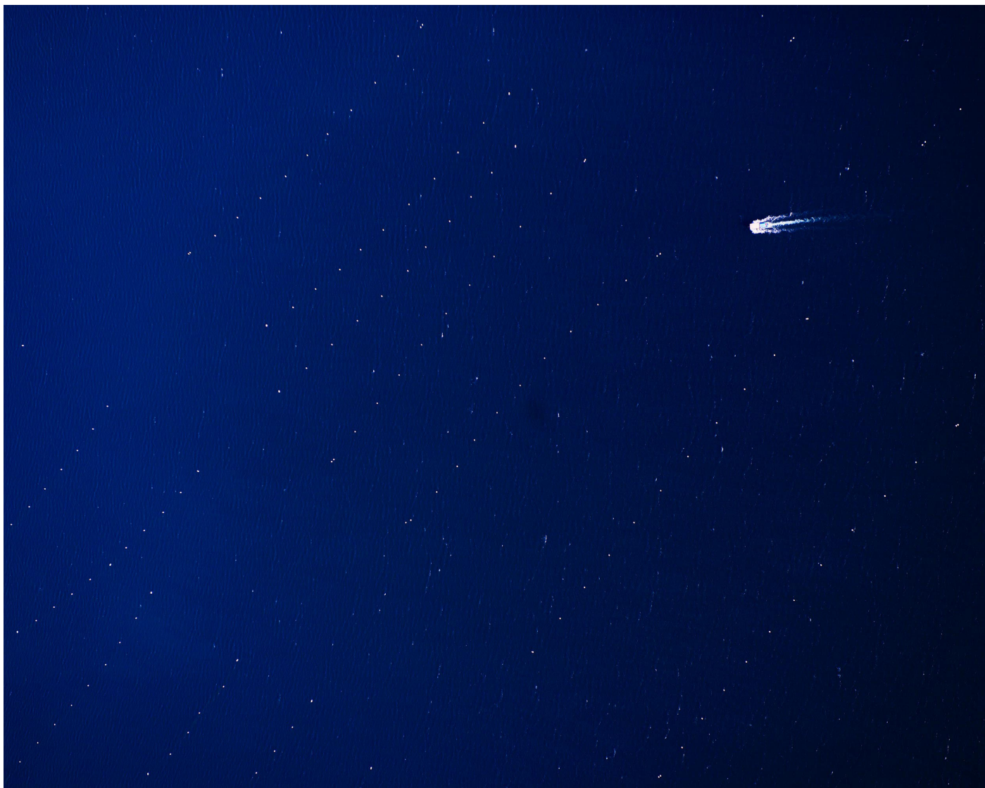
boat patrols along the buoy rows